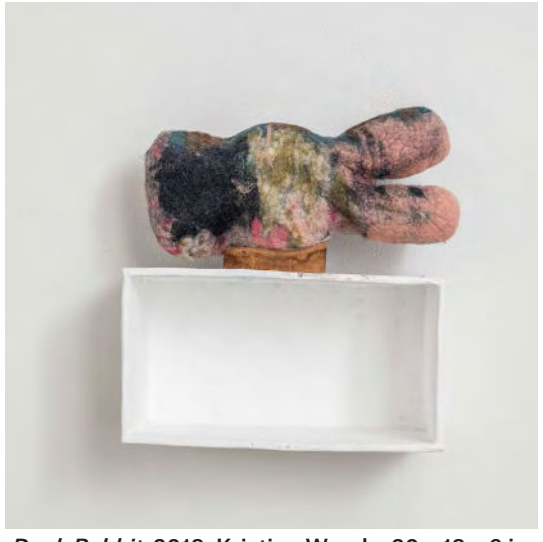
Duck Rabbit, 2018, Kristine Woods, 20 x 18 x 6 in.