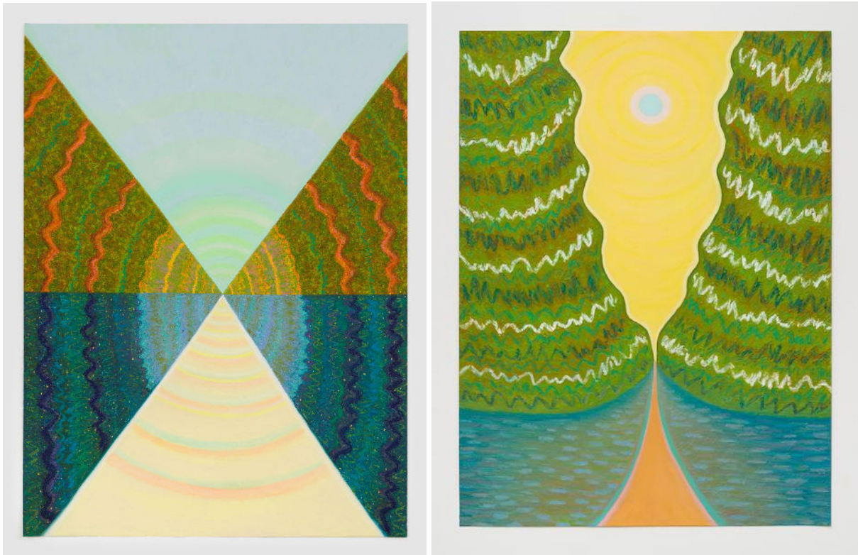
Left: Ping Zheng – Traveling , 2022 / Right: Ping Zheng – Sunlit Path , 2022