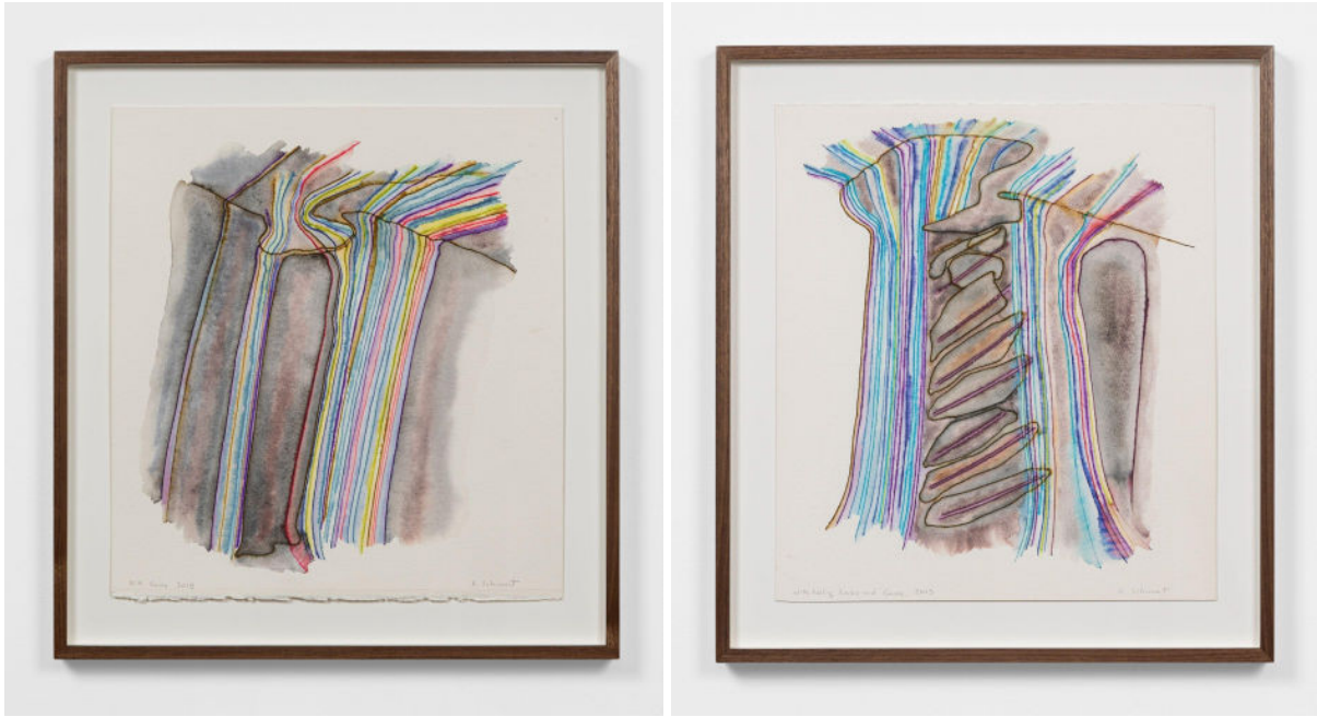
Left: Katy Schimert – With Caves , 2015 / Right: Katy Schimert – With Falling Rock and Caves , 2015